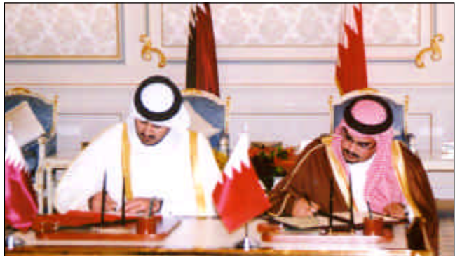
HH Sheikh Tamim Bin Hamad Al-Thani and HH Sheikh Salman Bin Hamad Al-Khalifa

Q atar and Bahrain have agreed to speed up the $2 billion causeway between the two countries. The decision has been taken at the two-day Qatari-Bahraini Joint Cooperation Committee session held under the co-chairmanship of Qatar's HH the Heir Apparent Sheikh Tamim Bin Hamad Al-Thani and Bahrain's Heir Apparent and Commander In Chief of Bahrain Defence Force HH Sheikh Salman Bin Hamad Al-Khalifa in Manama. The committee has decided to complete the necessary studies as soon as possible.