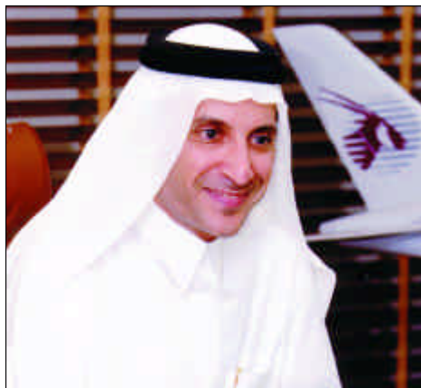
Akbar Al-Baker, Qatar Airways CEO

"From July 8 we will also be starting our non-stop service to Zurich. This will be a four-times-a-week service that will use our long