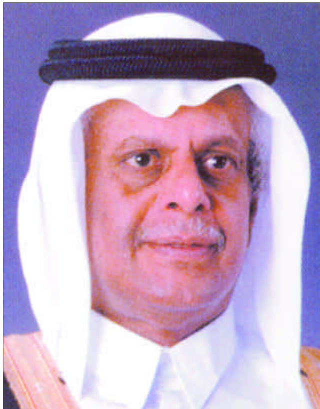
Abdullah Bin Hamad Al-Attiyah, Second Deputy Premier, Minister of Energy and Industry of the State of Qatar

"We in Qatar are proceeding with industrial development according to a well-advised strategy and realistic planning on the basis of which we choose the kind of projects we establish and the international companies that join us in establishing them, while carefully studying the needs of the world market and excellent quality of production", said the Emir.