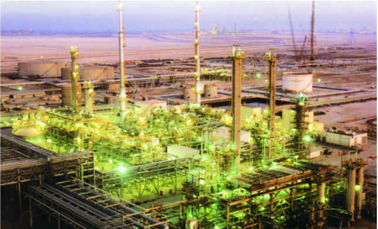
Qatar Petroleum Refinery