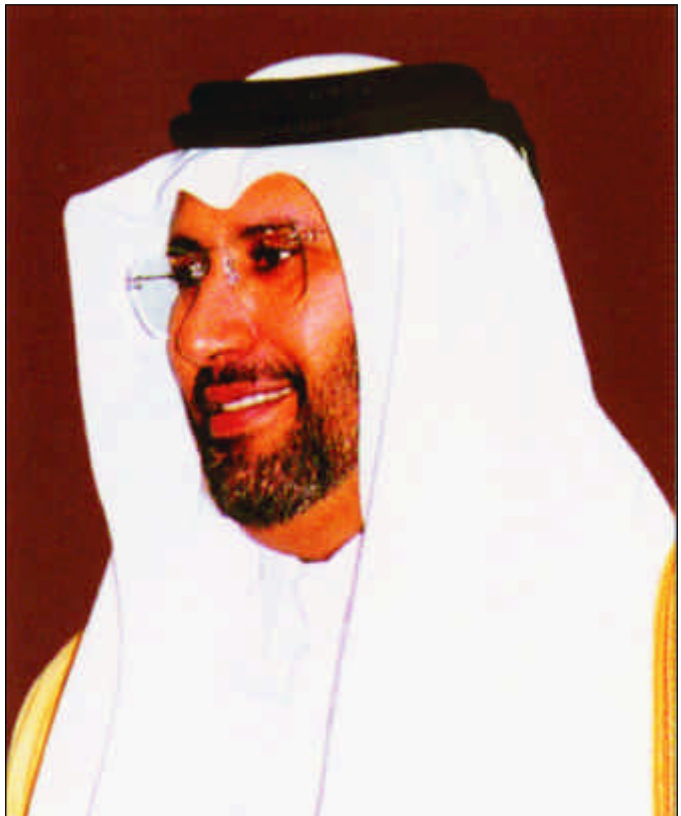
Sheikh Hamad Bin Jassim Bin Jabor Al-Thani First Deputy Premier and Minister of Foreign Affairs of the State of Qatar