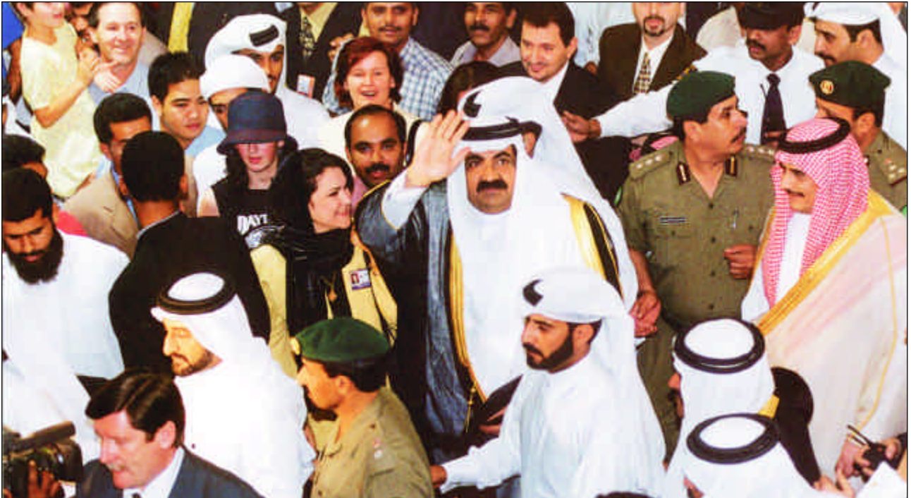
HH Sheikh Hamad Bin Khalifa Al-Thani, Emir of the State of Qatar

parliamentary elections. This approach which we have adopted in the policies and positions of the State of Qatar confirms our belief that our region is in need of witnessing a new era where the peoples are prepared for