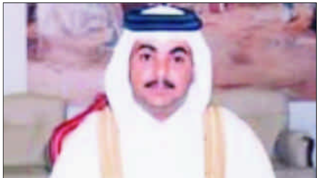
HE Sultan Hassan Al-Dhabit Al-Dousari Minister of Municipal Affairs and Agriculture of the State of Qatar

H H the Emir, Sheikh Hamad bin Khalifa Al-Thani, issued on March 23, 2004 an Emir order belonging to the reshuffling of the Minister cabinet.